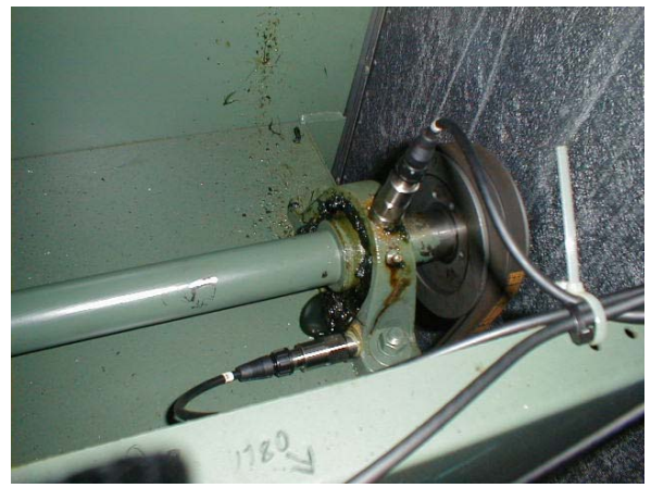
Loop Power Sensors to Monitor Bearing Vibration

not a dynamic analog signal, and it can not be used to analyze the machine fault, but it can be used to alarm the machine and indicate when vibration levels are too high.