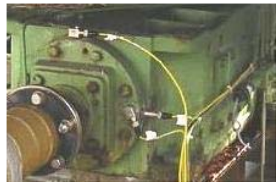
Accelerometers on a Gear Box

The practice of Vibration Analysis does require the measurement and analysis of rotating machines utilizing different vibration sensors (accelerometers, velocity transducers, or displacement probes). The most common sensor used in industry is the accelerometer.