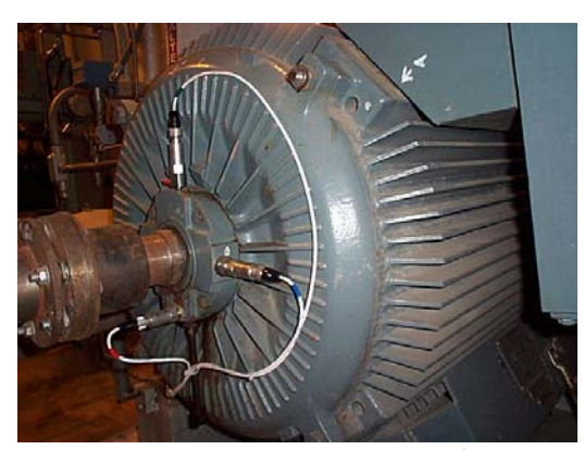
Measuring Motor Bearing Vibration

Typical machines include motors, pumps, fans, gear boxes, compressors, turbines, conveyors, rollers, engines, and machine tools that have rotational elements.