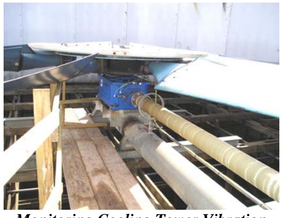
Monitoring Cooling Tower Vibration