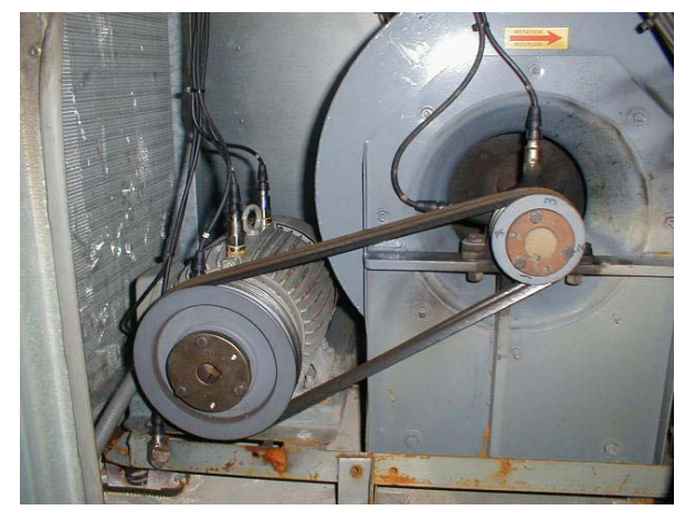
Monitoring Motor & Fan Vibrations

The measurement and analysis of dynamic vibration involves accelerometers to measure the vibration, and a data collector or dynamic signal analyzer to collect the data. Analysis is usually completed by a technician or engineer trained in the field of rotating machinery vibration.