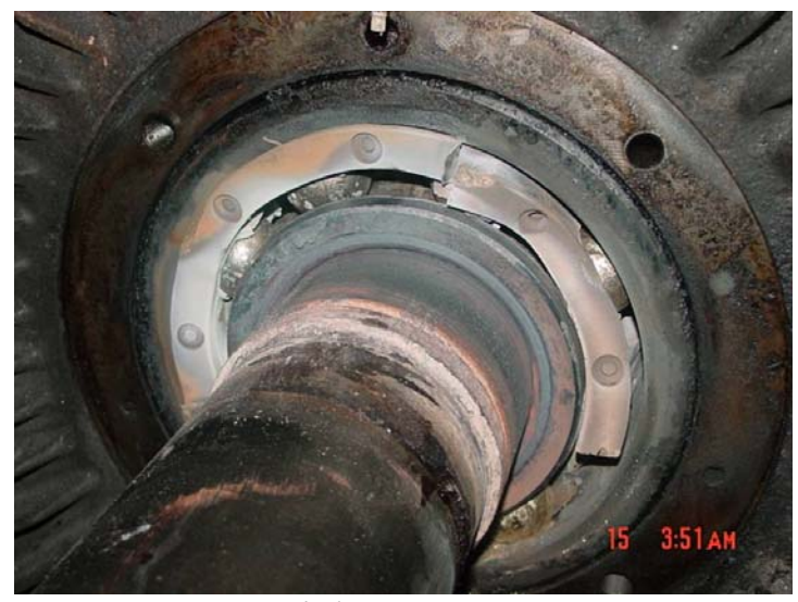
Failed Motor Bearing Don't Let This Happen To Your Machines!